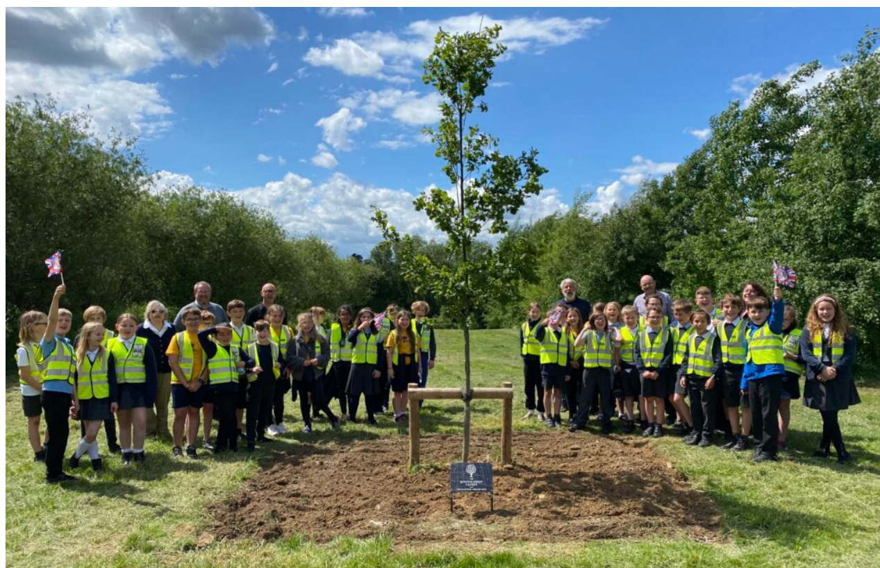
The Queen's Green Canopy Oak Tree celebration with children from King's Lodge School