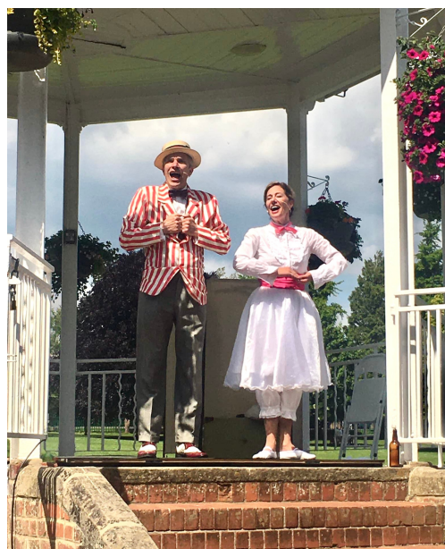
The Mary Lou Revue free community performance at John Coles Park